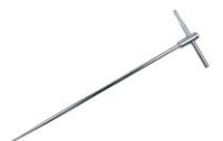
Earth contact test probe (rod), 80 cm WASONG80V2