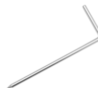
4 x earth contact test probe (rod), 25 cm WASONG25