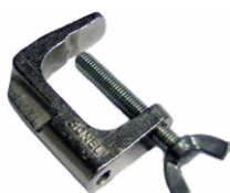
Cramp (banana plug) WAZACIMA1