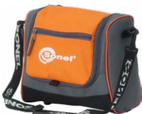
M6 carrying case WAFUTM6