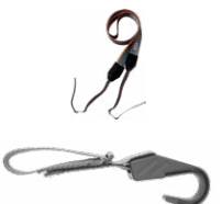
M1 hanging straps WAPOZSZE4 M1 hanging hook straps WAPOZUCH1