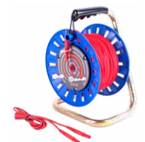
Test lead 100 m, red, for MRU (banana plugs, on a reel) WAPRZ100REBBSZ