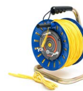
Test lead 200 m, yellow, for MRU (banana plugs, on a reel) WAPRZ200YEBBSZ