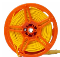
Test lead 40 m / 50 m / 60 m / 80 m for MRU (banana plugs, on a reel), yellow WAPRZ040YEBBSZ WAPRZ050YEBBSZ WAPRZ060YEBBSZ WAPRZ080YEBBSZ